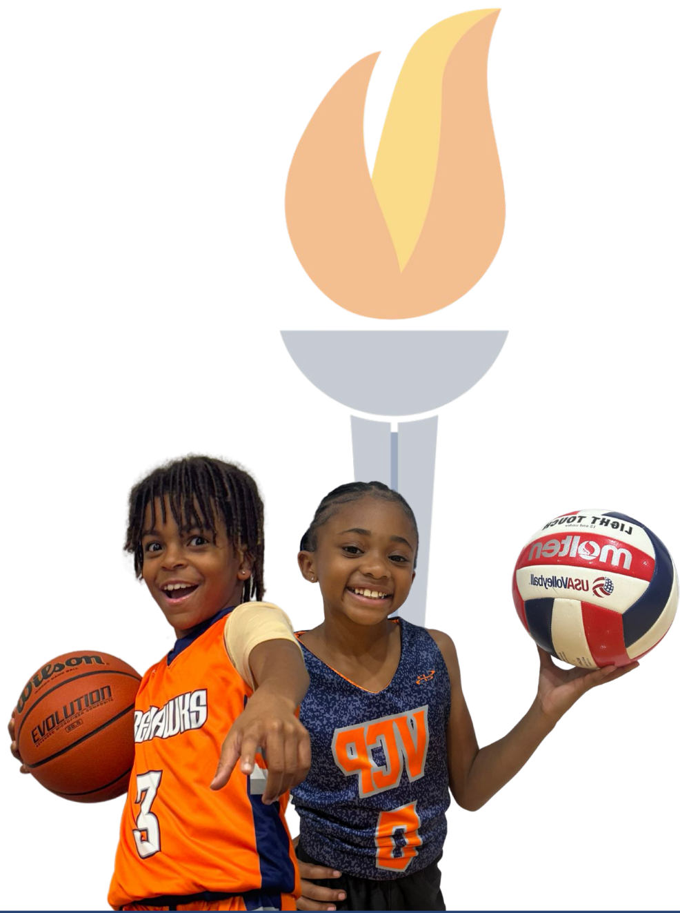
VCP IS THE HOME OF FIREHAWKS ATHLETICS